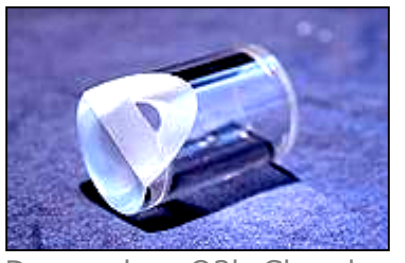
Duran glass O2k-Chamber

The O2k-Chambers are made of Duran glass and are closed by PVDF or PEEK stoppers which are as diffusion tight as titanium. The magnetic stirrer bars are coated by PVDF or PEEK. Teflon is avoided due to high oxygen solubility (<u>Gnaiger</u> <u>1995</u>). Viton O-rings are used for sealing the stoppers. Butyl rubber gaskets provide the seals for the oxygen sensors. These sealing materials