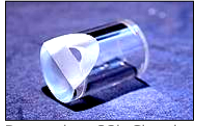
Duran glass O2k-Chamber

The O2k-Chambers are made of Duran glass and are closed by PVDF or PEEK stoppers which are as diffusion tight as titanium. The magnetic stirrer bars are coated by PVDF or PEEK. Teflon is avoided due to high oxygen solubility (<u>Gnaiger 1995</u>). Viton O-rings are used for sealing the stoppers. Butyl rubber gaskets provide the seals for the oxygen sensors. These sealing materials