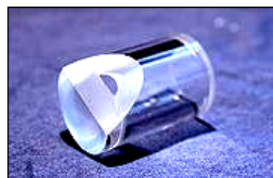
Duran glass O2k-Chamber

The O2k-Chambers are made of Duran glass and are closed by PVDF or PEEK stoppers which are as diffusion tight as titanium stoppers. The magnetic stirrer bars are coated by PVDF or PEEK. Teflon with its high oxygen solubility is avoided ( Gnaiger 1995 ). Viton O-rings are used for sealing the stoppers. Butyl rubber gaskets provide the seals for the oxygen sensors. These sealing materials minimize oxygen diffusion into or out of the experimental chambers.