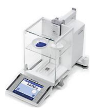
METTLER TOLEDO microbalance XS205DU

Weight measurements are made after permeabilization, eliminating variations in water contents due to osmotic stress, allowing for elimination of connective tissue during mechanical separation before weight measurement, and for partitioning of subsamples of similar wet weight.