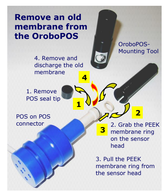
Removal of a used membrane from the OroboPOS.

Accessories for sensor service are provided in the <u>OroboPOS-Service Kit</u>. In addition, distilled water and 25% ammonia solution (fresh) are required. Store the OroboPOS in the dark.