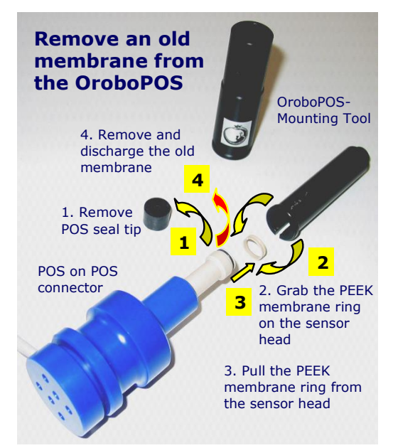
Removal of a used membrane from the OroboPOS.

Accessories for sensor service are provided in the <u>OroboPOS-Service Kit</u>. In addition, distilled water and 25% ammonia solution (fresh) are required. Store the OroboPOS in the dark.