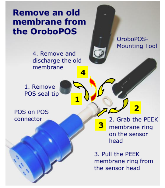
Removal of a used membrane from the OroboPOS.

Accessories for sensor service are provided in the OroboPOS-Service Kit. In addition, distilled water and 25% ammonia solution (fresh) are required. Store the OroboPOS in the dark.