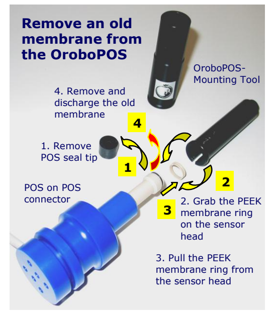
Removal of a used membrane from the OroboPOS.

Accessories for sensor service are provided in the OroboPOS-Service Kit. In addition, you need distilled water and 25% ammonia solution (fresh). Store the OroboPOS in the dark.